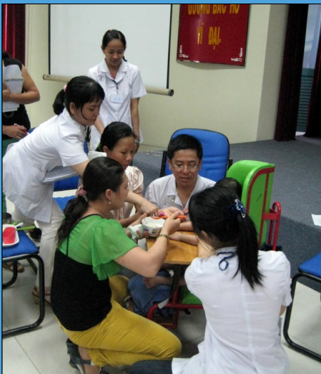
Some of the students working with a patient at Children's Hospital Number 1